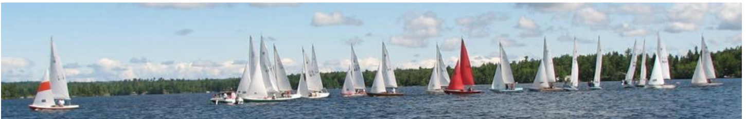
Race Start at 2010 NODRA Worlds Championship Regatta Held at ALYC, Nova Scotia